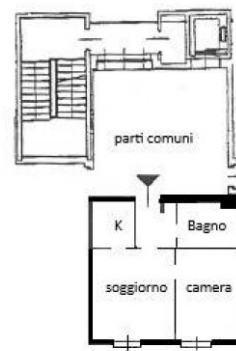
Via Muratori 30 Piano 3°